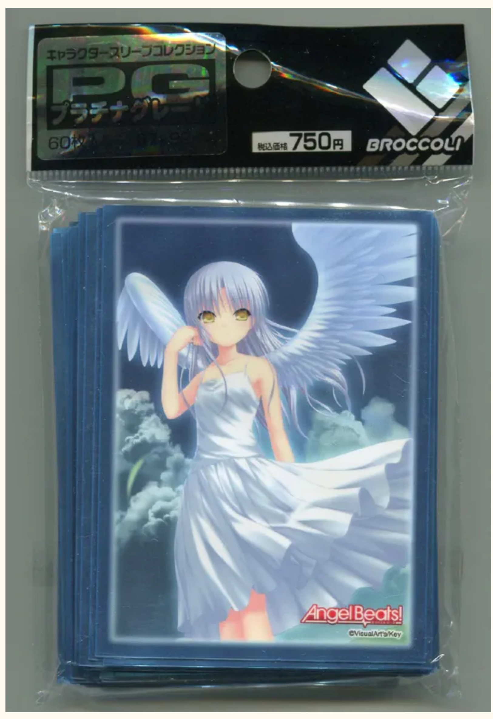
Don't you love her More knowing she was invested in, the upfront costs gathered?

You can find a place to market your dreams and loves, and its not selling out. There will always be a market somewhere made up of the people who believe in love like you. It becomes crystalized, it gets released, it gets brought, it gets kept and sold. Your Product-Arts or Art-Products can integrate into lives, be speculated upon.