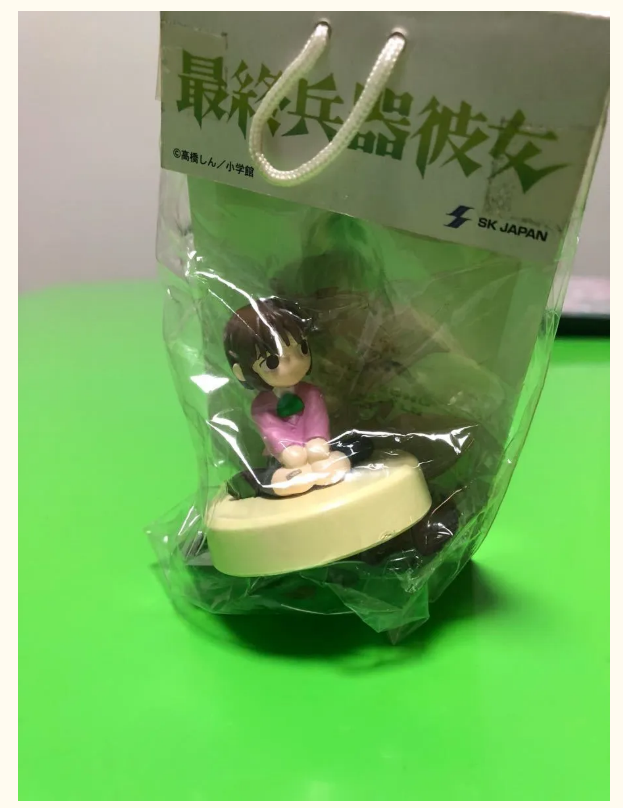
Chise from "Saikano: The Last Love Song on This Little Planet" or "She: The Ultimate Weapon"

Her Moe-elements were selected by her maker, they had to be justified to investors, the creative had to believe and make others believe. "No Sir, you don't understand, We have to keep the band-aids on her knees, she must look left. We cannot cut these corners" Its Romantic i think, you have to sell <sup>3</sup> love to yourself, others and to the one you love. You bring her home to meet your parents, gain their blessing. Marry.